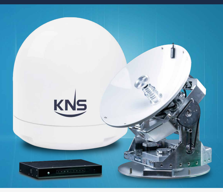
* This Specification can be changed without notice.

The true four-axis stabilization system of C_Series keyhole effect even though when you are cruising the Equator region. You will feel definite difference of quality within budget.